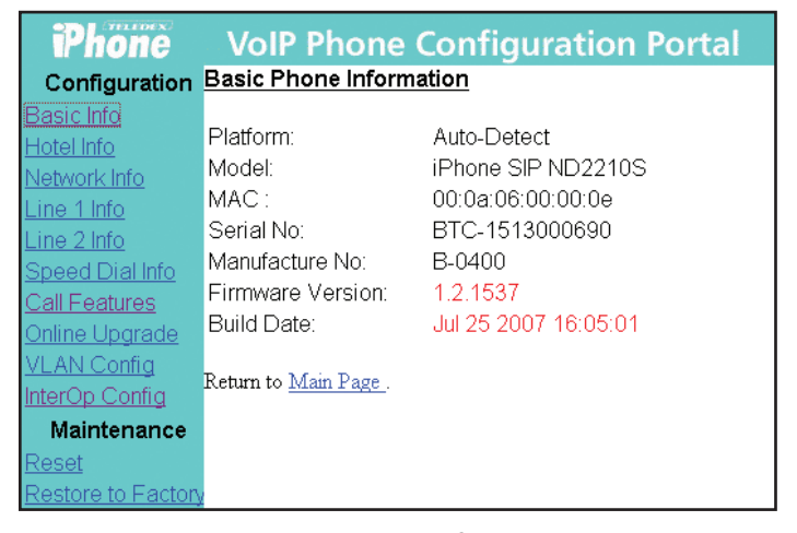
Fig 2: Teledex iPhone Configuration Portal

NOTE: Except for upgrading the software online (decribed in subsection 3.2.7), the configuration for the SIP LD series will not be activated until the phone has been reset.